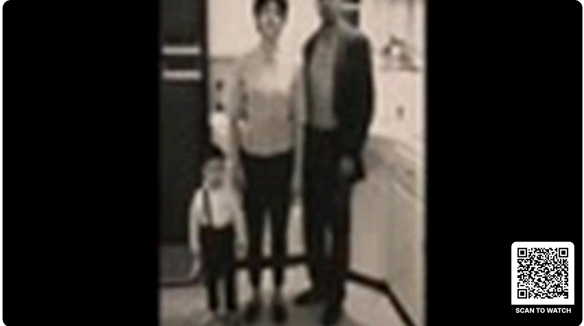
A remembrance video for my grandma.