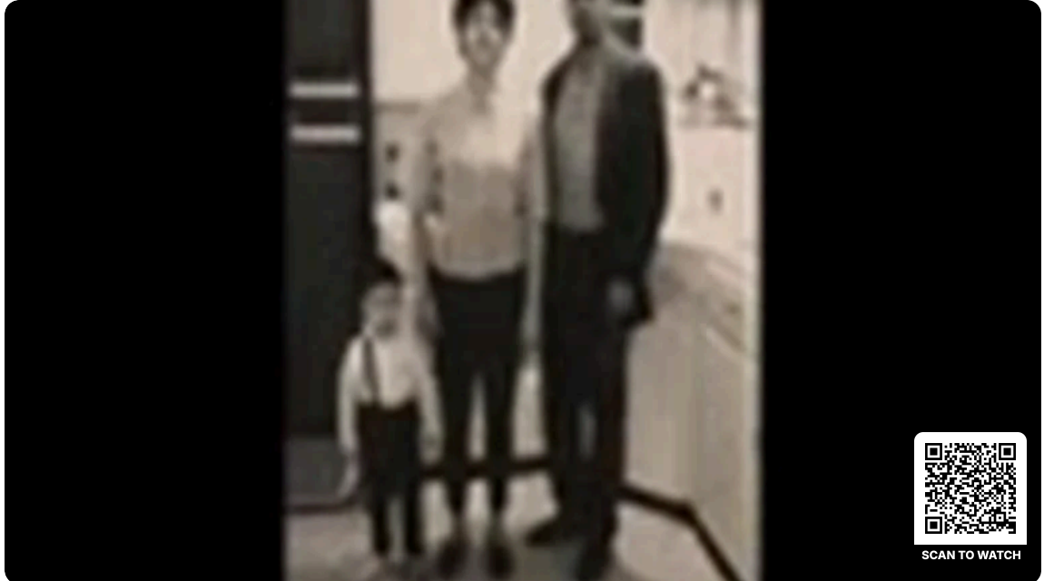
A remembrance video for my grandma.